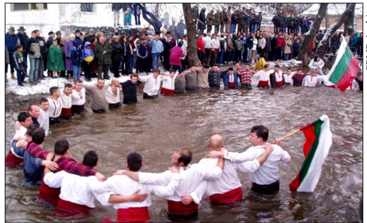
Cultural traditions bring the entire community together Central Balkan National Park, Bulgaria

Most of the studies can be downloaded at www.panparks.org/projects/research