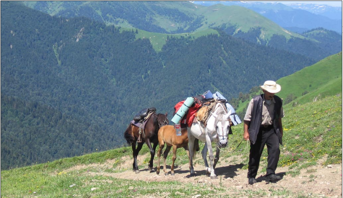
Borjomi-Kharagauli National Park, Georgia