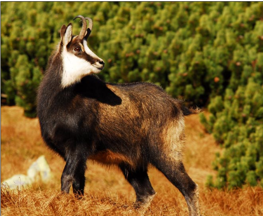
Retezat National Park, Romania

In the past, several universities worked on different PAN Parks related studies, often concurrently, and it resulted in a need for a more structured research approach in order to ensure optimal contribution to the problems we faced during the implementation phase of our concept. Thus the PAN Parks Research Network was created in 2003 to coordinate all of the different research projects. The Research Network started thanks to the large number of useful student reports that were produced by students and faculty at, among others, the University of Applied Science in Breda NHTV, and the Wageningen University for Life Sciences, both located in the Netherlands.